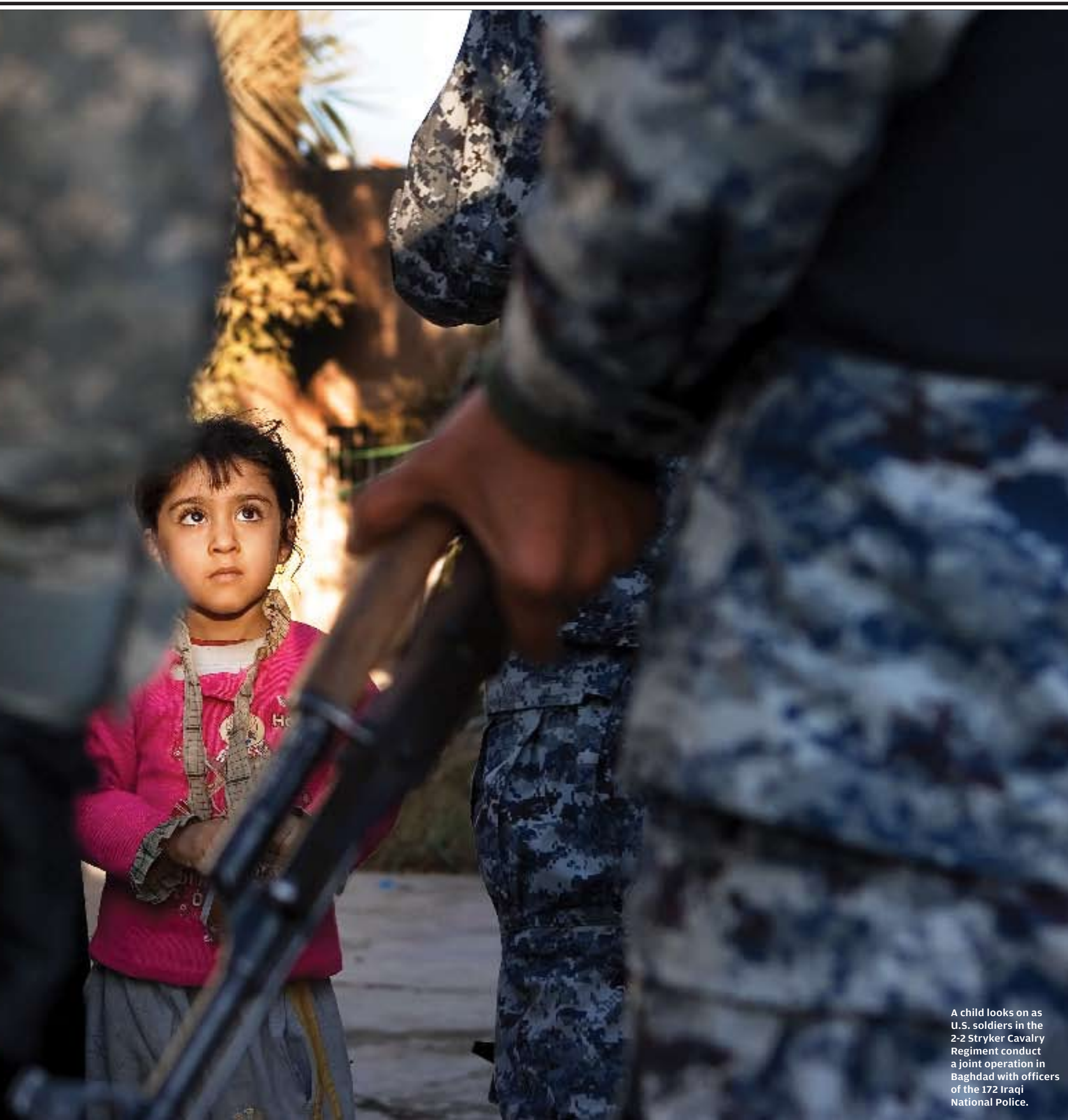
A child looks on as U.S. soldiers in the 2-2 Stryker Cavalry Regiment conduct a joint operation in Baghdad with officers of the 172 Iraqi National Police.

IT'S A COLD, GRAY DAY in December, and I'm walking down Sixtieth Street in the Dora district of Baghdad, one of the most violent and fearsome of the city's no-go zones. Devastated by five years of clashes between American forces, Shi'ite militias, Sunni resistance groups and Al Qaeda, much of Dora is now a ghost town. This is what "victory" looks like in a once upscale neighborhood of Iraq: Lakes of mud and sewage fill the streets. Mountains of trash stagnate in the pungent